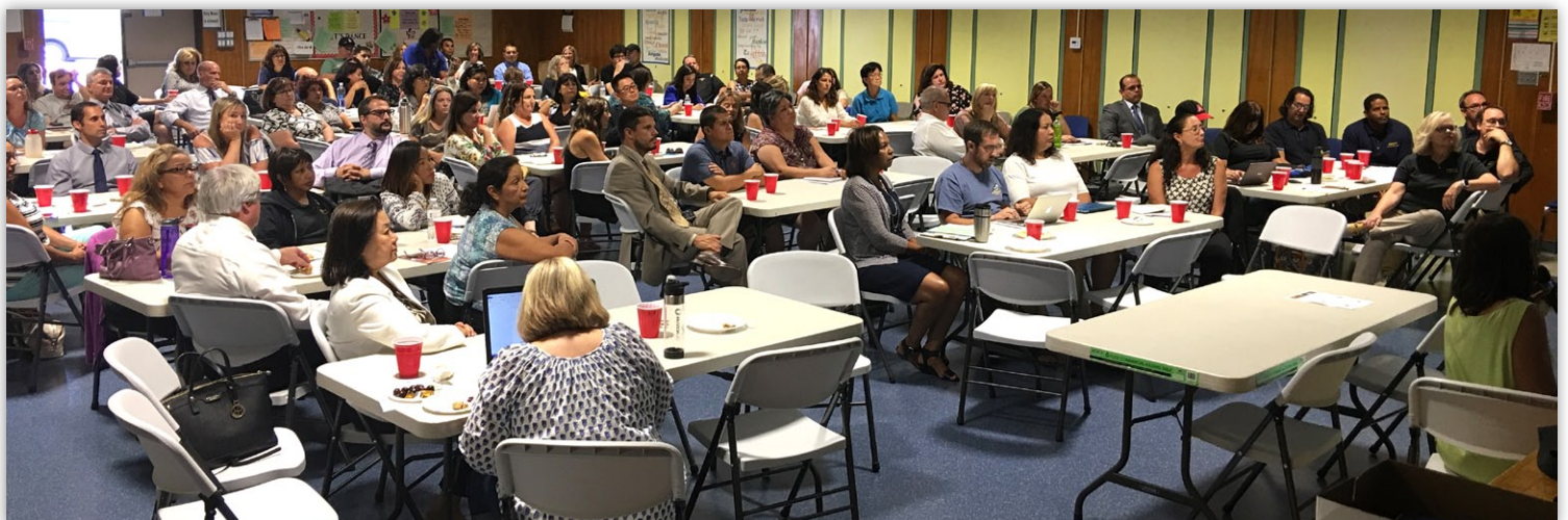
PAL Advance at Cabrillo Lane on August 16, 2017